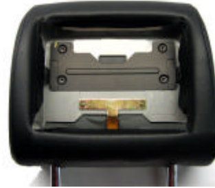
Headrest cushion with electronics mounting bracket installed

Step 3: Install the 4 supplied mounting screws to fully attach the mounting bracket